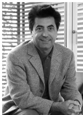
Designed by Italian architect Antonio Citterio (left), the new Hansgrohe Axor Citterio provides ergonomic design and water-saving technology